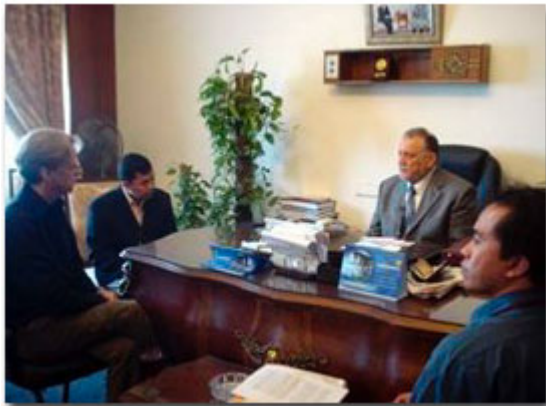
President of al-Azhar University and Chairman of the Egyptian Parliament's Committee on Religion Ahmed Omar Hashem (left) welcomed LibForAll's presence in Egypt, and offered full cooperation in future activities. Dr. Hashem has been deeply involved in Egyptian efforts to persuade former Islamic Jihad terrorists to renounce the ideology of religious extremism.