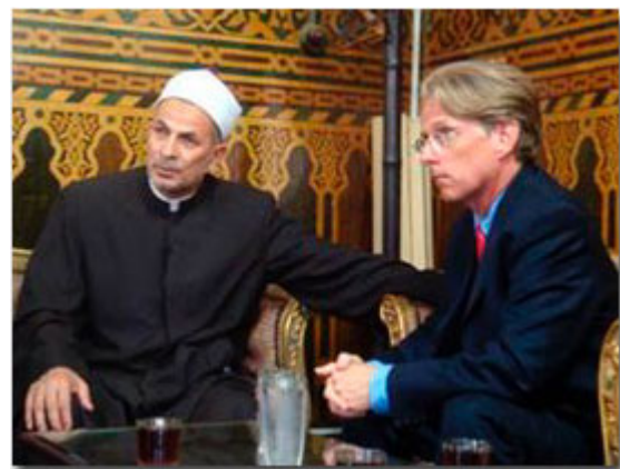
The Deputy Minister of Religious Endowments (right) likewise praised LibForAll's work, setting the stage for continued expansion of LibForAll activities in the Middle East, where government cooperation can prove vital in efforts to impact society as a whole.