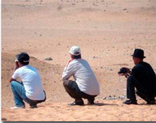
LibForAll crew filming the pyramids in Giza (above) and the skyline of Islamic Cairo (right)