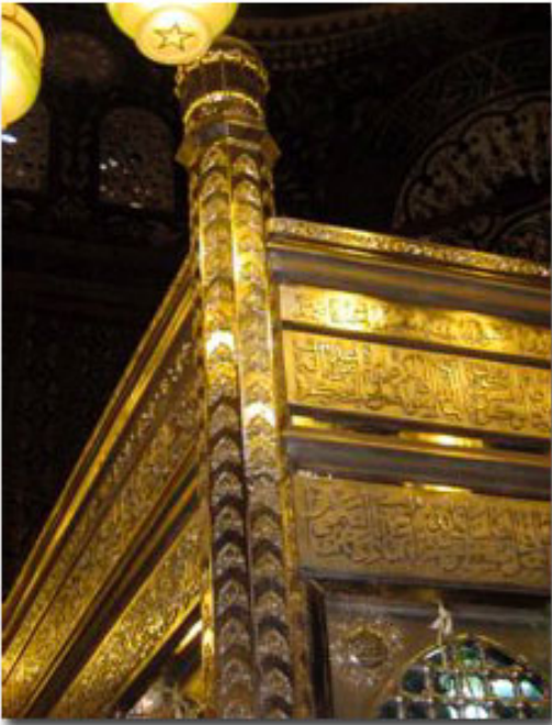
Sites filmed for the television series include the tomb of Sayyid Hossein, grandson of the Prophet Muhammad (left) and the mosque of al-Azhar (below)